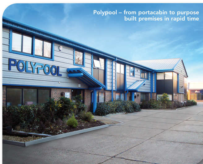
Polypool – from portacabin to purpose built premises in rapid time

"The show was important for us. We had something new to show and the business simply grew from there to the point